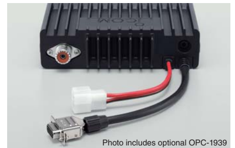
Photo includes optional OPC-1939

With the optional OPC-1939 D-SUB 15-pin ACC cable, the IC-F5022 series can be programmed to control an operating channel from an external device (up to 16 preprogrammed channels). The ACC connector also provides an ignition sensing function, external PTT, PC command, horn honk, audio output and modulated signal input depending on programming.